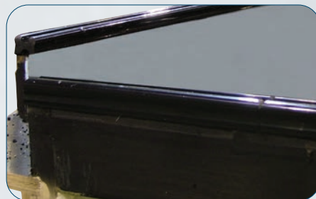
COVER ALL™ BASE SYSTEM