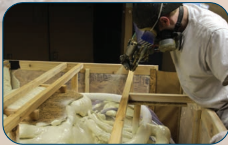
THERMAL BOND™ WRAP INSULATION

A product purposefully built to last. We combine the integrity of handcrafted construction with strategic equipment technology. Efficiency and Durability combined.