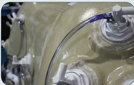
PROTEGRITY™ RIGIDIZING SYSTEM

No stain, no splinter, no problem with MultiWeather™ Cabinets.