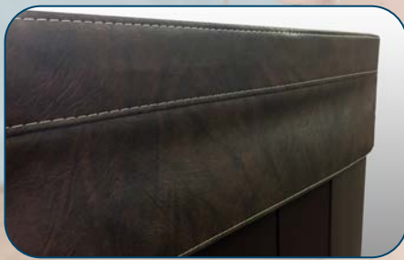
INSULATING SPA COVER

Creating a balance inside through purposeful planning